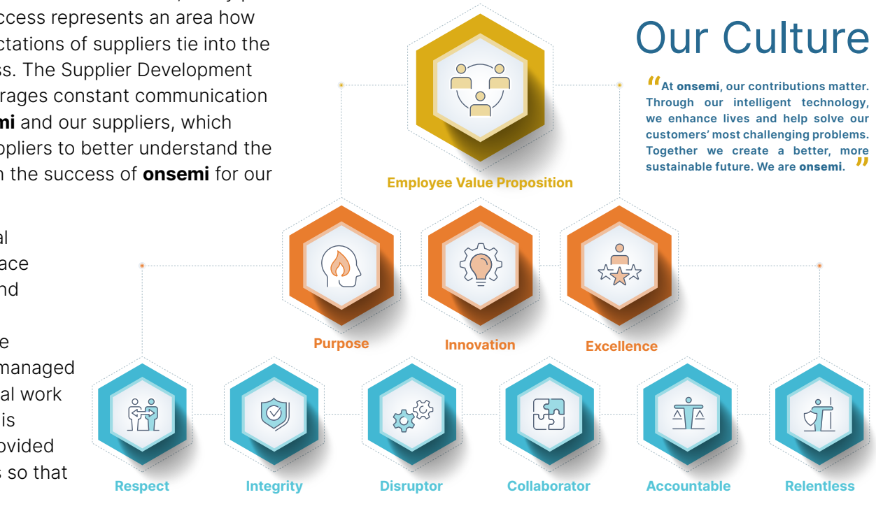
Figure 1. Culture of Success

Building quality relationships with other companies gives onsemi a competitive advantage.